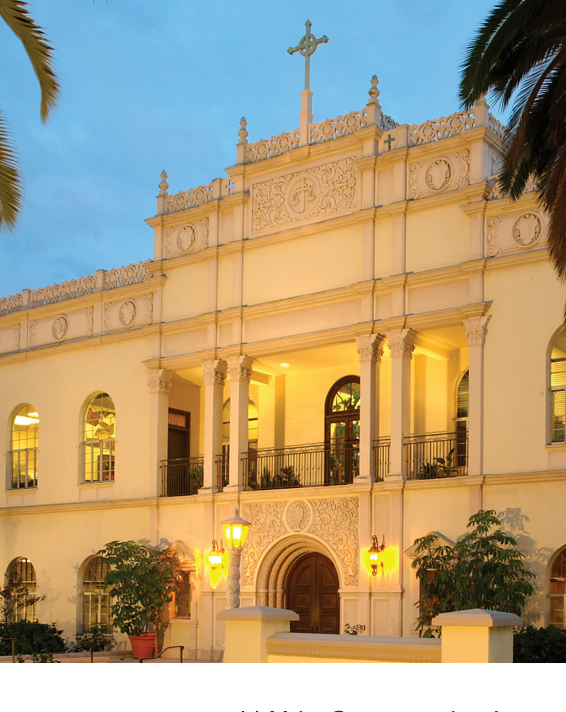
LLM in Comparative Law UNIVERSITY OF SAN DIEGO SCHOOL OF LAW